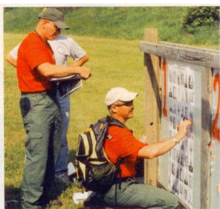
Scorers check the targets for hits and misses during the National Patrol Rifle Competition.